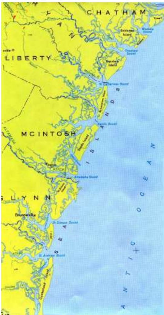
Georgia's Coastal Barrier Islands